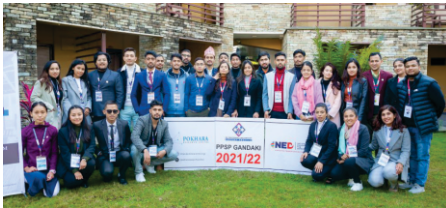
2021/22: Gandaki Cohort 2